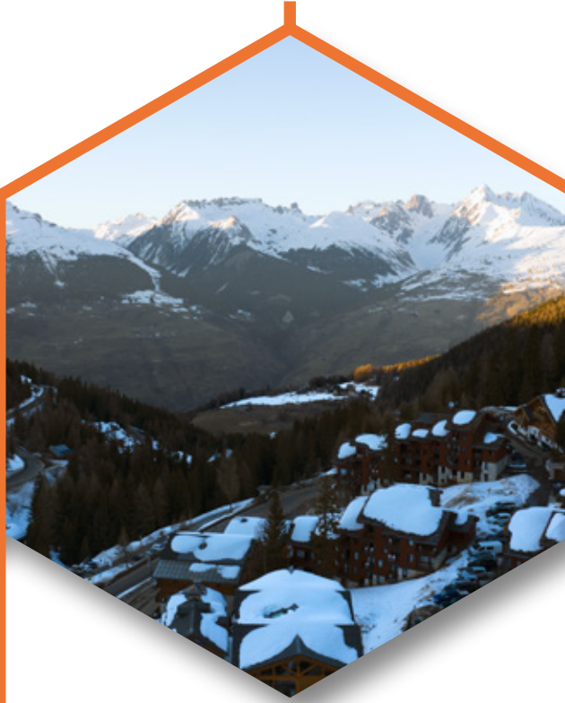
La Plagne 1800 to 2100m

On the high northern slopes of the Vanoise massif, in the Tarentaise valley, is nestled La Plagne. With a total of 11 village resorts, each with its own atmosphere, you are bound to find something to suit you.