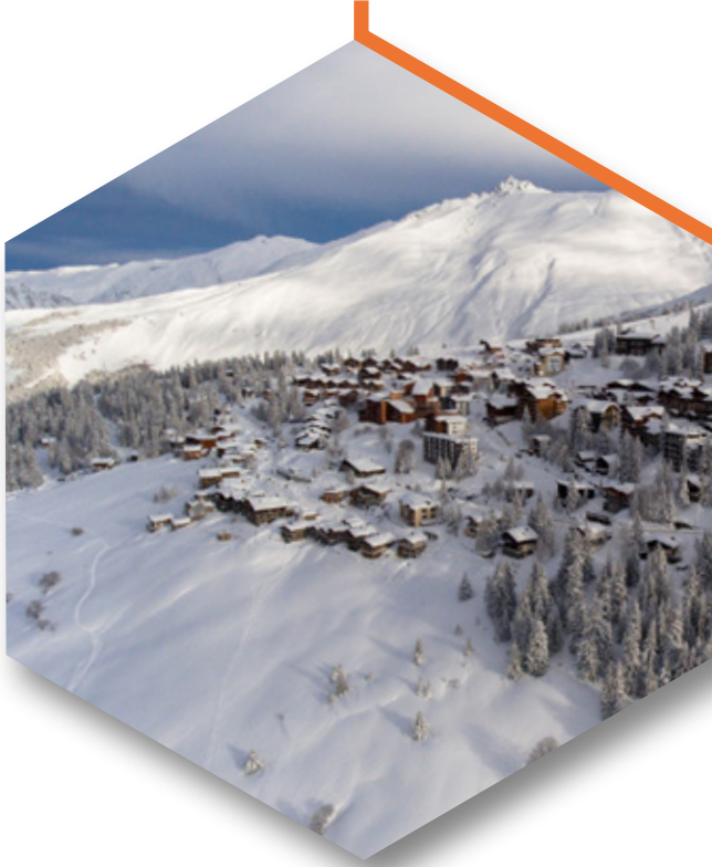
La Rosière 1850m

In the heart of the Haute-Tarentaise, inside the Franco-Italian ski area of San Bernardo (Italian border at 10 minutes drive), La Rosière resort is the ideal destination to enjoy winter activities: skiing, but also snow golf.