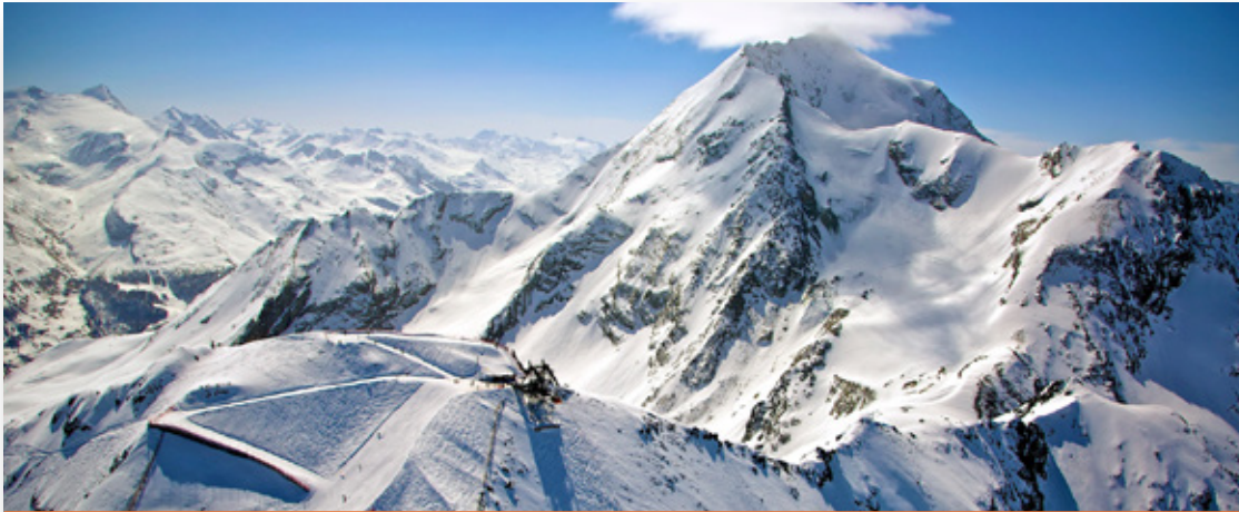
Les Arcs 810 to 3800m

The resort of Les Arcs is divided into 5 sites located at different altitudes: Arc 2000, Arc 1950, Arc 1800, Arc 1600 and Bourg-Saint-Maurice at 810m. Each altitude has a different atmosphere, depending on what you want to bring to your event, and all of them are located in an exceptional setting and benefit from a very high quality of snow, in addition to a lively and festive atmosphere. A unique activity is also located here: the Aiguille Rouge zip line.