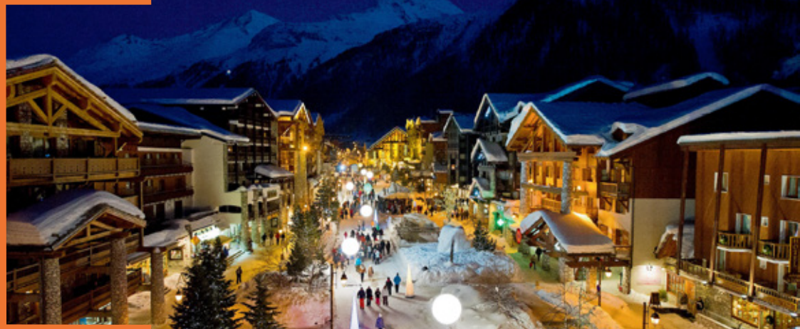
Tignes 1550 to 2100m

To enjoy the best snow, this is the place to be. From September to May, the offbeat and innovative atmosphere of Tignes attracts athletes from around the world! Of varying difficulty, Tignes shares its ski slopes with Val d'Isère, stretching over 300km, between 1550 and 3450 meters of altitude.